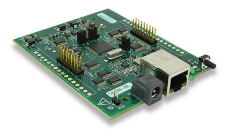
The E-DIO24-OEM has the same specifica tions as the standard device

The E-DIO24-OEM has a board-only form factor with header connectors for OEM and embedded applications (no case, CD, or Ethernet cable). The device can be further customized to meet customer needs.