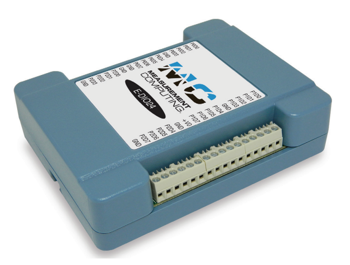
The E-DIO24 provides 24 lines of digital I/O with ±24 mA drive capability