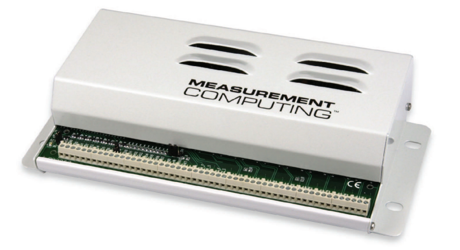
The USB-1608HS Series provides simultaneous sampling at rates up to 250 kS/s per channel.