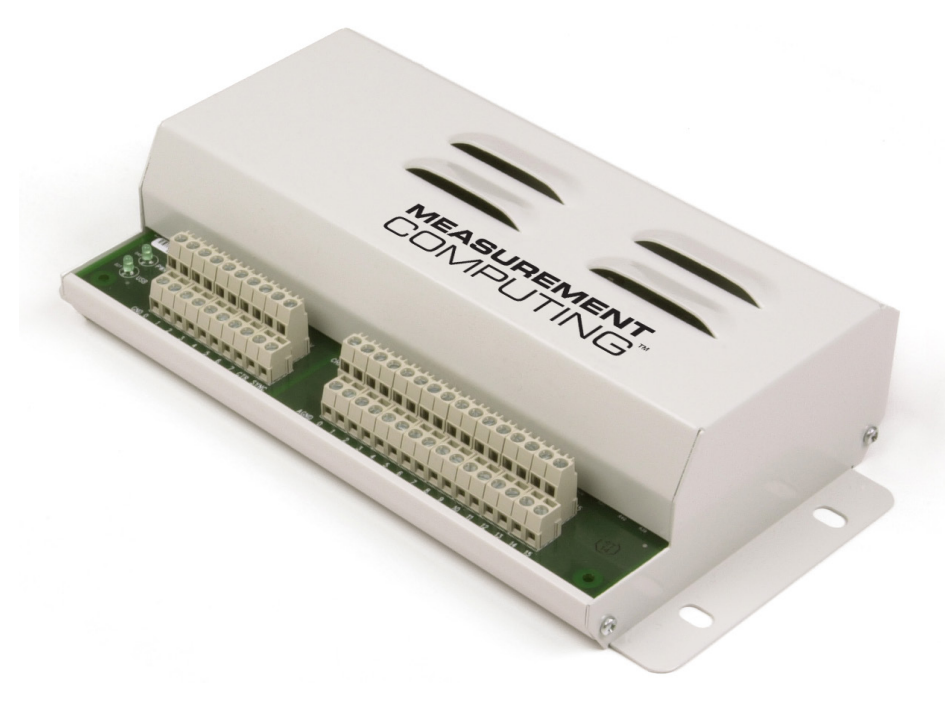
The USB-1616FS features simultaneous sampling of 16 single-ended analog inputs, 8 DIO lines, and a 32-bit event counter