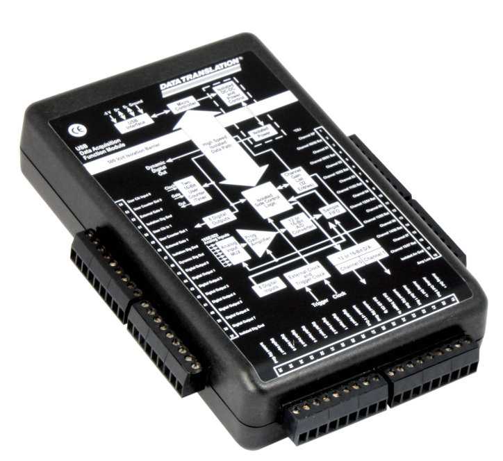
The DT9800 Series is a family of USB function modules for data acquisition.

All DT9800 Series modules support 16 single-ended or pseudo-differential analog input channels or eight differential analog input channels. Software selectable gain settings of 1,2,4, and 8 provide effective input ranges of \pm 1.25 V, \pm 2.5 V, \pm 5 V, and \pm 10 V. On the DT9801 and DT9801, you can specify a unipolar range of 0 – 10 V.