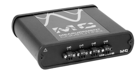
The USB-2404-10 and USB-2404-60 (above) provide four isolated, 24-bit simultaneous sampling analog inputs supporting \pm 10~V or \pm 60~V voltage ranges