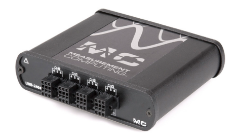
The USB-2404-UI provides four isolated, simultaneous analog inputs with support for voltage, current, thermocouples, RTDs, resistance, and bridge-based sensors.