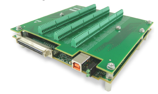
USB-2637 connected to TB-103 screw-terminal board.

The optional TB-103 screw terminal board connects directly to the 40-pin headers on a USB-2600 Series board, and secures to the board with the included stand-offs. The TB-103 provides access for up to 64 SE analog inputs (when using a USB-2633 or USB-2637), up to 4 analog outputs (when using a USB-2627 or USB-2637), 24 digital I/O and all counters/timers.